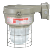
Wall w/ 7-3/4" Refractor & Guard