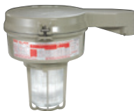
Stanchion Straight w/ 5-1/2" Refractor & Guard