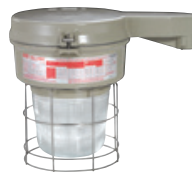
Stanchion Straight w/ 7-3/4" Refractor & Guard