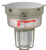
Ceiling w/ 5-1/2" Globe & Guard