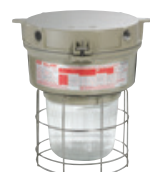
Ceiling w/ 7-3/4" Globe & Guard