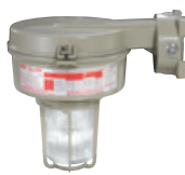
Wall w/ 5-1/2" Refractor & Guard